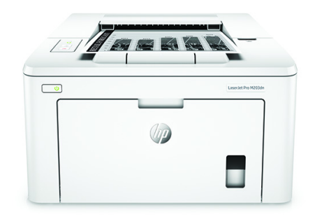
HP LaserJet Pro M203dn Printer

Get more pages, performance, and protection from a wireless HP LaserJet Pro powered by JetIntelligence Toner cartridges. Set a faster pace for your business: print two-sided documents right away, and easily manage to help maximise efficiency.