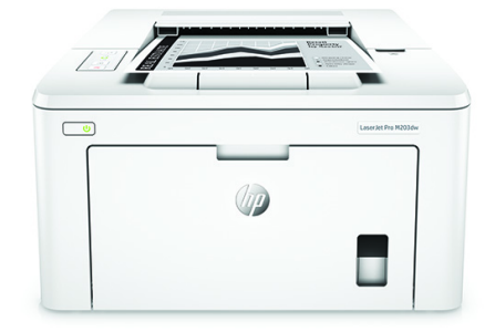
HP LaserJet Pro M203dw Printer